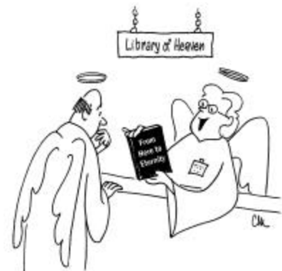
"Hello, I'm Matilda, a volunteer librarian. Our featured book of the millenium is 'From Here to Eternity.'"

Figure 5 shows the breakdown of positions into which new volunteers were placed, by Department and Division. (The numbers on the following table add up to 333 because one of these volunteers holds two positions.)