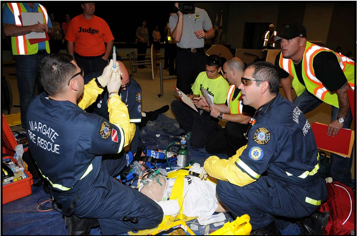
The Margate Fire Rescue Team working through a scenario.