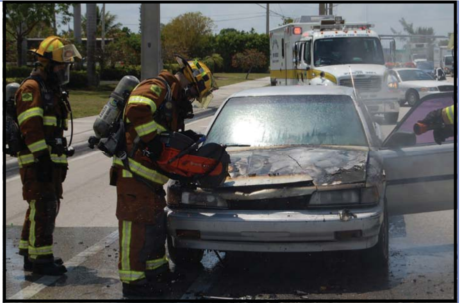
Lt. Tony Armijo looks on as Firefighter/Paramedic Donnie Mullens uses a saw to cut open the car hood.

On April 21, 2009, Boca Raton firefighters responded to a call for a vehicle on fire at 200 West Yamato Road. Emergency dispatchers received the 9-1-1 call at the same time as firefighters at Fire Station #4 had citizens knocking on the door reporting the same. Firefighters arrived within minutes to find a 1988 Toyota Camry with flames coming out from under the engine compartment. The vehicle was stopped in the middle lane, eastbound on Yamato Road just west of NW 2 nd Avenue. Fire crews pried open the hood and knocked down the fire. Firefighters used special rescue tools to open the hood and put the remainder of the fire out. The cause of the fire is unknown at this time and no injuries were reported.