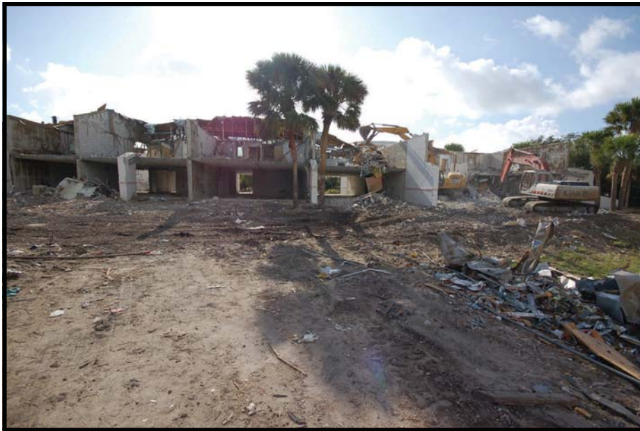
Elysium being demolished.

citizens as well as to firefighters. The demolition work should be completed around the middle of June. The building will be demolished down to the slab except for the racquetball and tennis courts which will be left standing. The pool has had holes punched in the bottom and will be filled with dirt prior to the completion of the work. Attached are two pictures of the demolition in process.