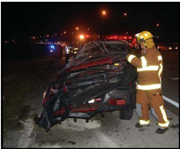
Vehicle roll-over on I-95.

Shortly after midnight on May 23, 2009, Boca Raton Fire Rescue was called to a vehicle rollover at the southbound entrance ramp to I-95 at Yamato Road. Crews arrived to find the 1998 Isuzu Trooper sitting upright on the shoulder of the roadway. The driver of the vehicle said that his tire blew out and then he lost control of his vehicle. The driver, which was the only person in the vehicle, was transported in stable condition to Boca Raton Community Hospital for evaluation. Florida Highway Patrol was on scene investigating the incident.